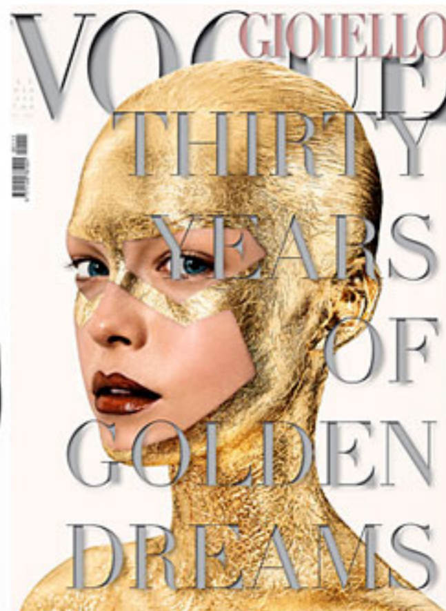
James Franco on the 'Candy' cover and a 'Vogue' cover.