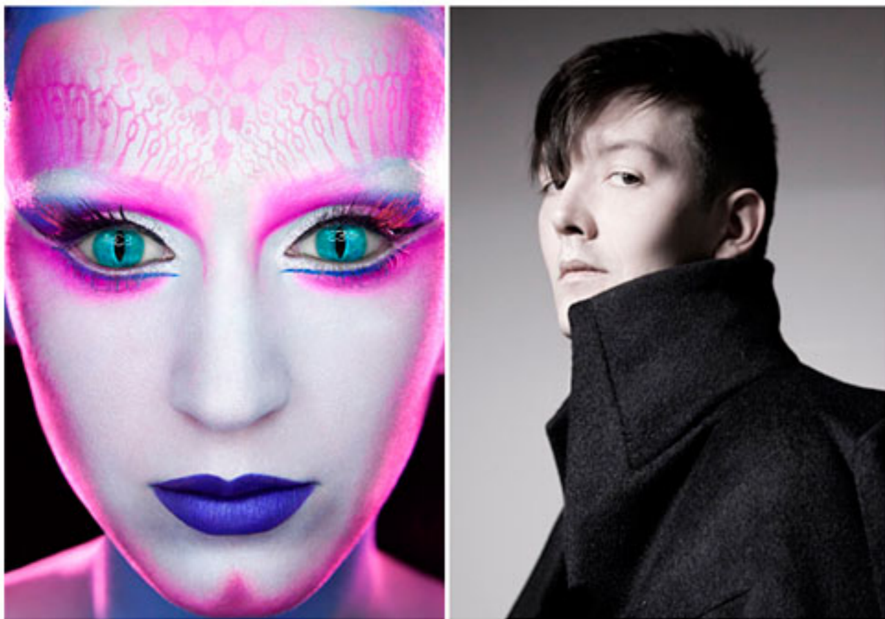
Katy Perry from her 'E.T.' music video and Kabuki.

Posted 18 hrs ago by MTV Style in Beauty, Interviews