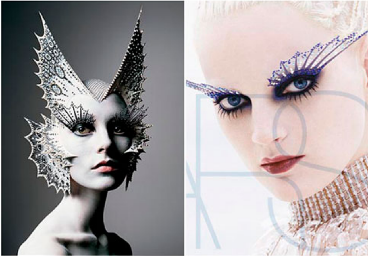
'Paper' magazine cover and the NARS Fall 2005 ad campaign.

Cher, first and foremost; David Bowie in 1972, his glam rock period (I wouldn't be a makeup artist if it weren't for him); Grace Jones; Elizabeth Taylor; Greta Garbo – an endless list, really.