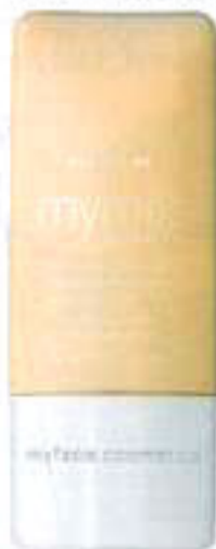
Myface Mymix Foundation in Fair, £12.71 From Boots.