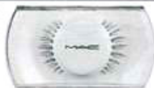
MAC False Lash 33, £8.50.