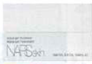
Nars Aqua Gel Hydrator, £56 Visit narscosmetics.co.uk .