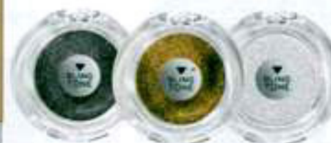
Myface Blingtone Single Eye Shadow in Black Ice, Sp'ice'y and Diamonds & Pearls, £9.78 each.