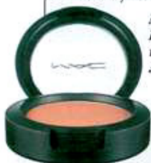
MAC Blushcreme in Lilicent, £16.50.

Everything you will need to recreate Kylie's look at home: